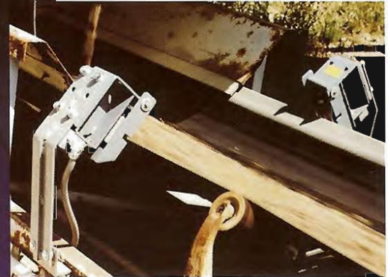
Shown are two BA units protecting a valuable conveyor belt from damage due to belt misalignment or run-off at an aggregate facility

the bottom of the roller assembly to hold it away from the switch except during actuation.