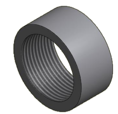
CR-85: HALF COUPLING 1 1/4" NPT SCALE 1 : 1