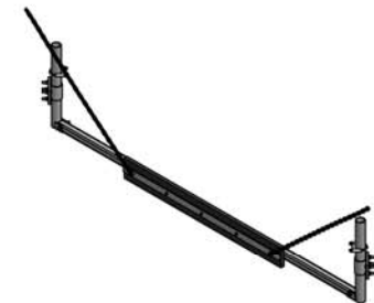
VIEW 3 SCALE 1 / 16